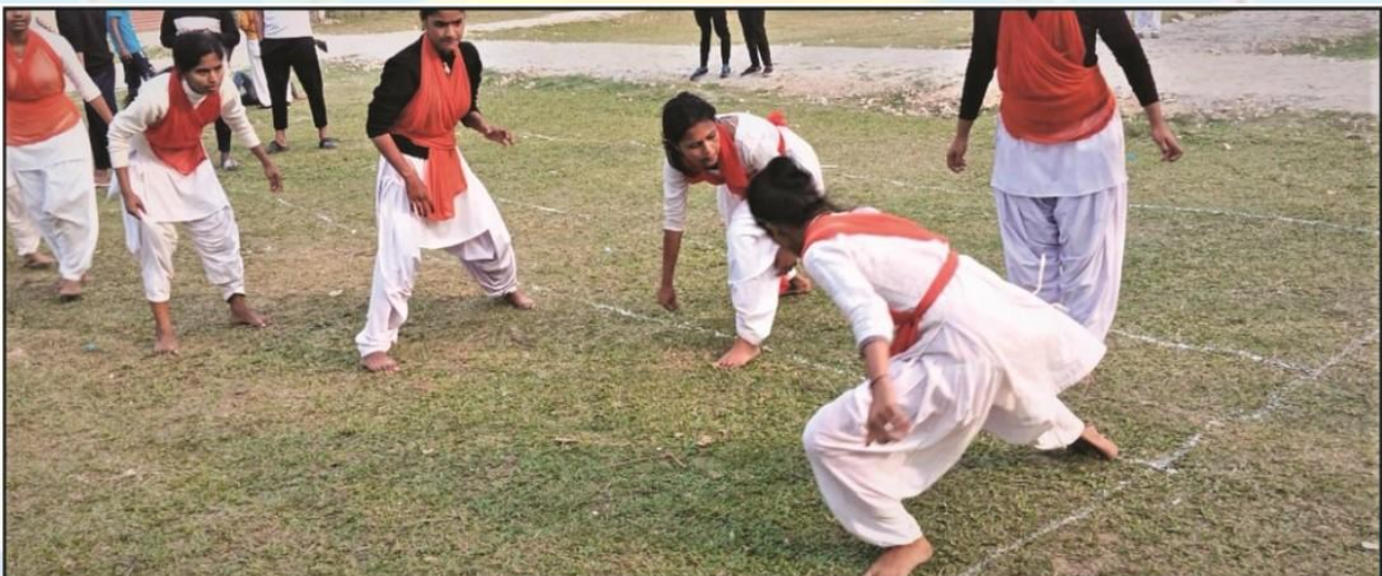
A Scene of Girls' Kabaddi in Annual Sports-2025

Ragging of any sort is strictly prohibited. The college has its anti-ragging committee and anti-ragging squad. The victims of ragging are requested to contact with the principal or any of the members of the faculty.