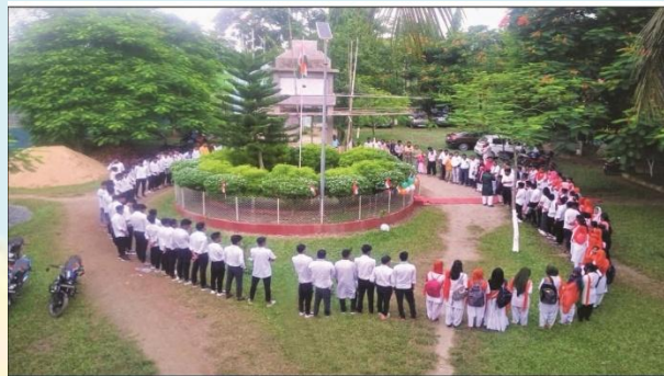
Flag Hoisting Ceremony