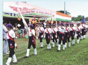
Participation in District Level Independence Day Parade

A brief description of these courses is given below.